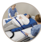
Patient positioning devices