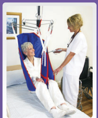
SLINGS & BELTS

For over 20 years, Vancare has been a leading manufacturer of mobile floor lifts in the US. With innovative products and commitment to outstanding service, VANCARE is also one of the few companies in the Safe Patient handling market that manufactures its quality lifts and slings from start to finish.