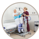
Standing and raising aids