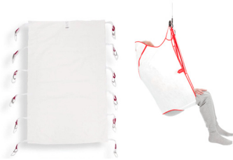
Breathable Repositioning Sheets & Slings