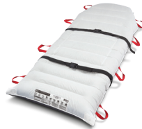
Air Transfer & Positioning System