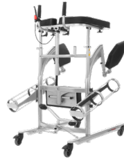
Early Patient Mobility